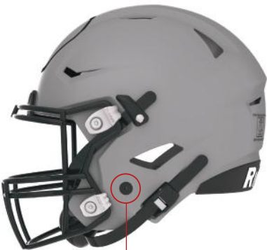
Face Frame Pads (Left/Right)